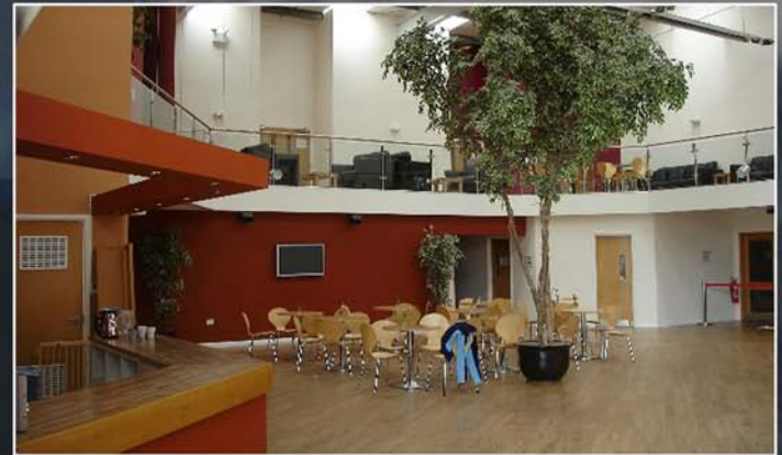
Illustrative photo from St Albans Vineyard warehouse conversion showing cafe area and foyer